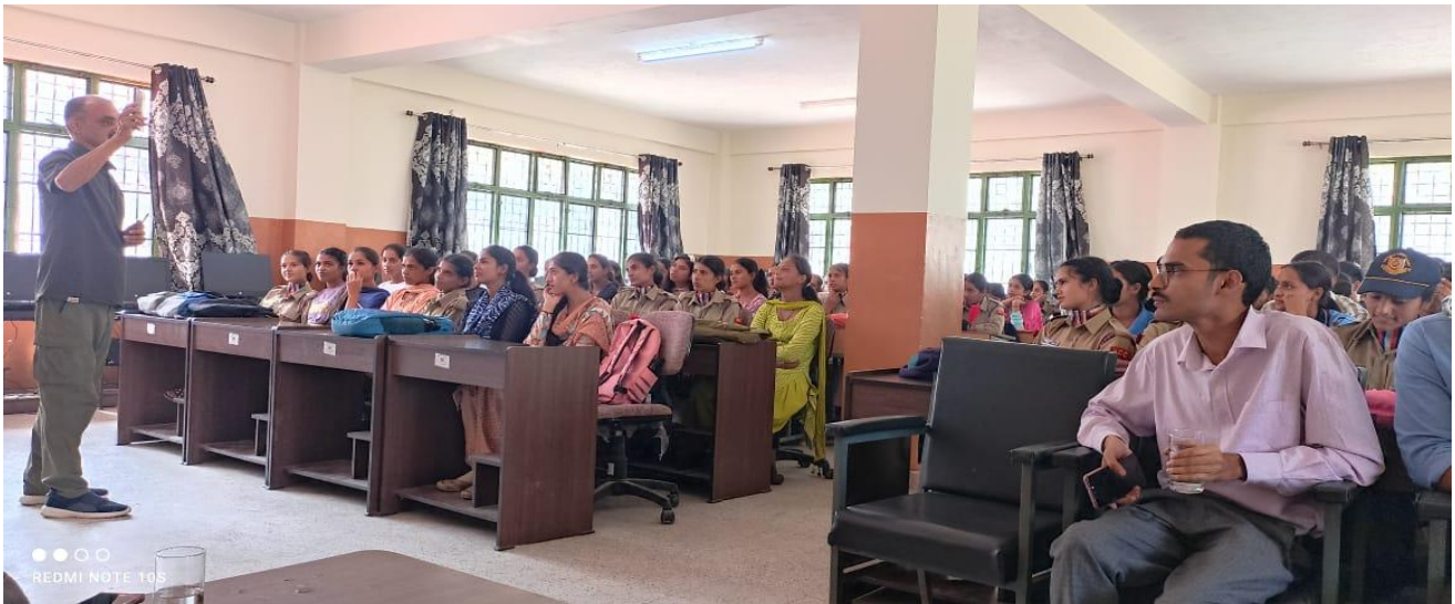
IQAC Coordinator Govt. Degree College Salooni Distt. Chamba, HP